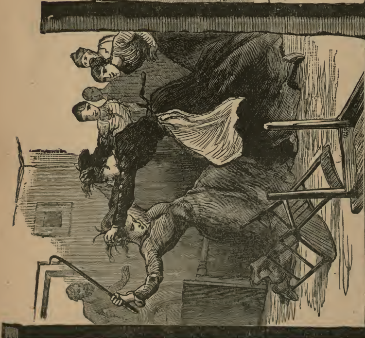
THE JEALOUS WIVES