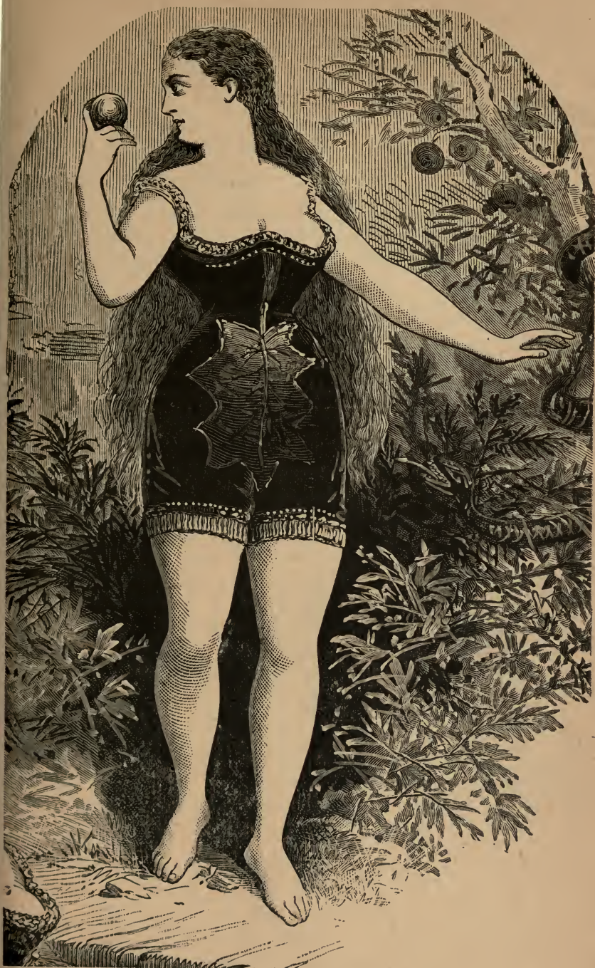
THE MORMON EVE.