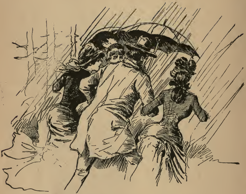
DEVOUT MORMONS ON THEIR WAY TO THE TEMPLE, RAIN OR NO RAIN.