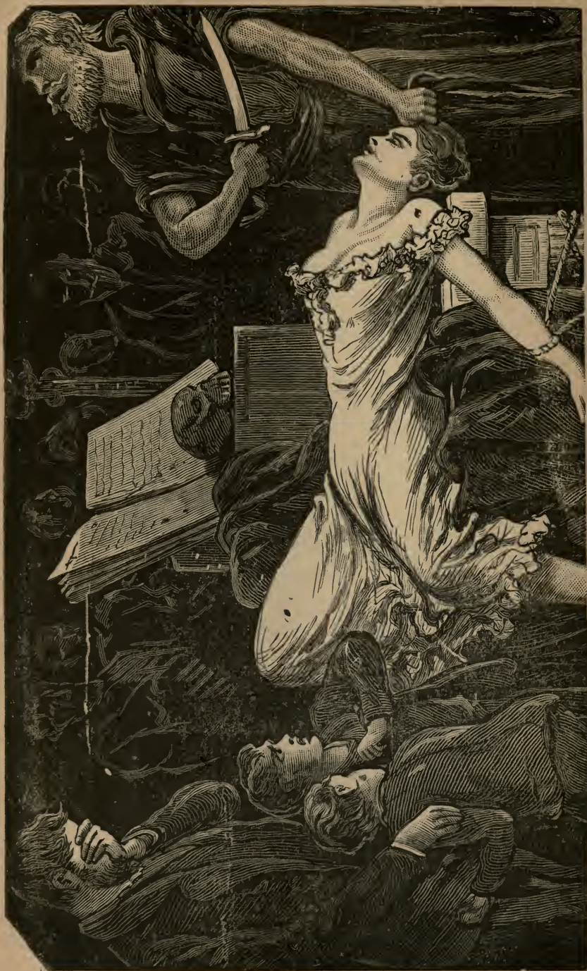
THE ATONEMENT OF BLOOD.