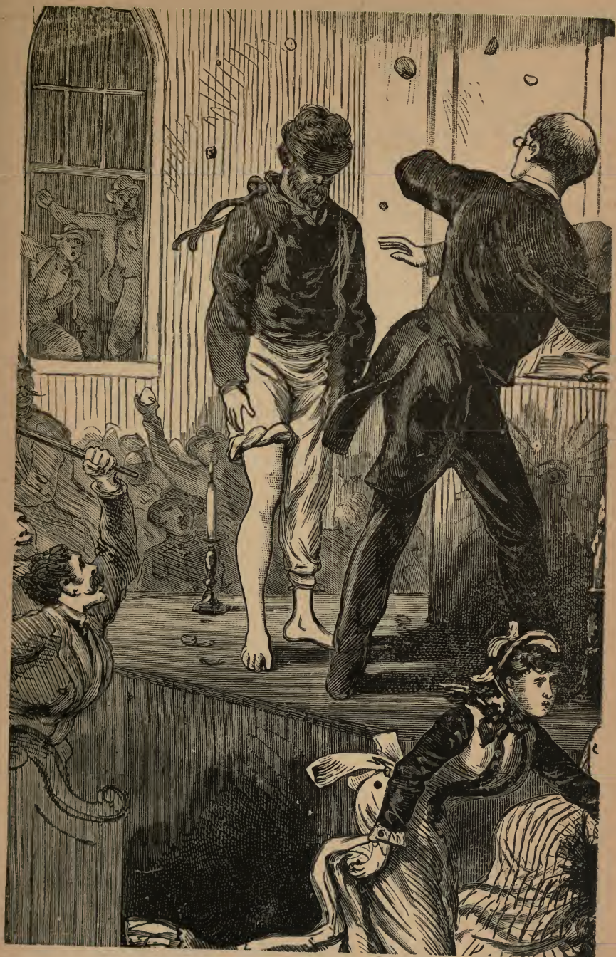
MOBBING A MORMON MEETING.