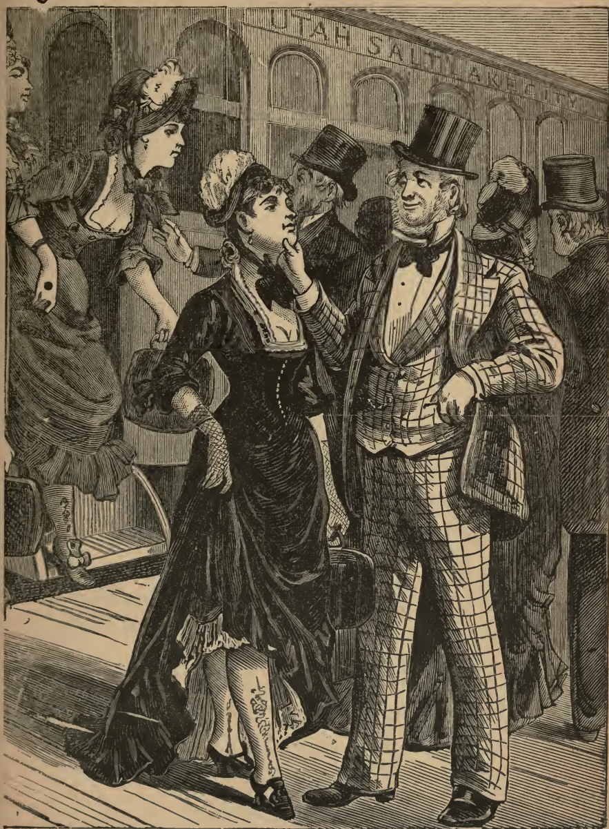
ARRIVAL OF AN INSTALLMENT OF WIVES AT SALT LAKE.