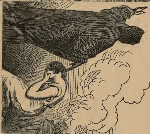
A MYSTERY OF THE TEMPLE.