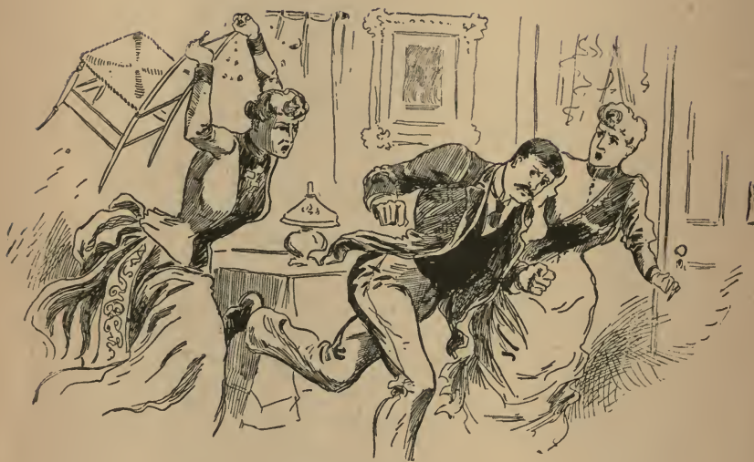
SHE WAS TYRANNICAL.