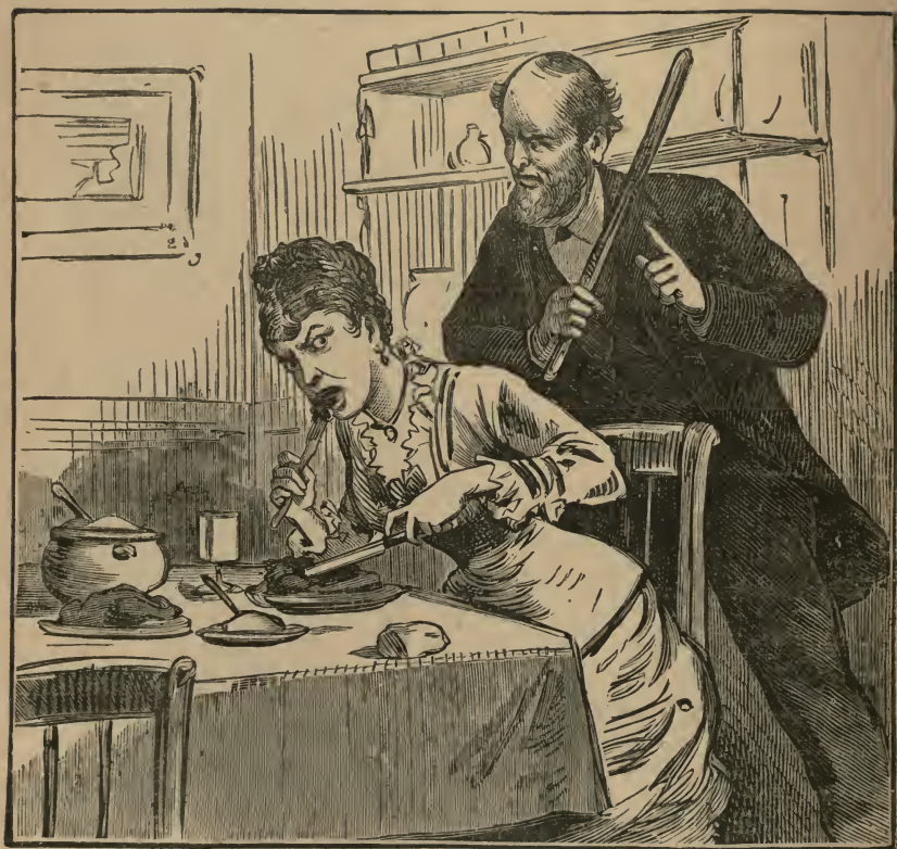
MORMON HOUSEHOLD DISCIPLINE.