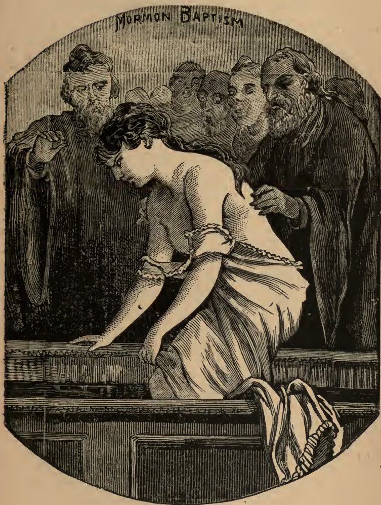
THE MORMON REBECCA.