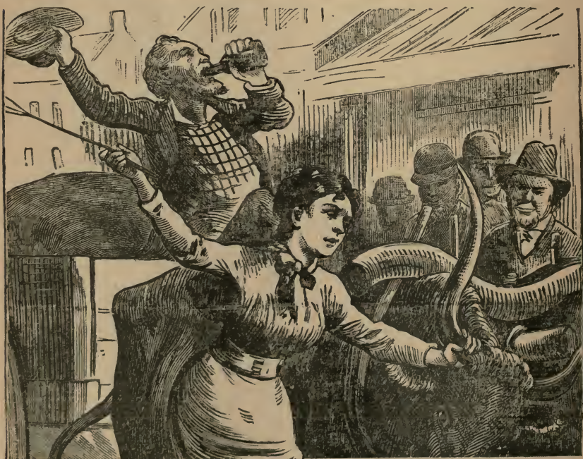
A MORMON HOME RULER.