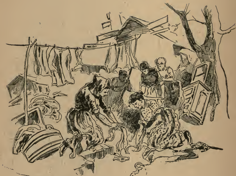
THE WIVES OF A POOR MORMON.