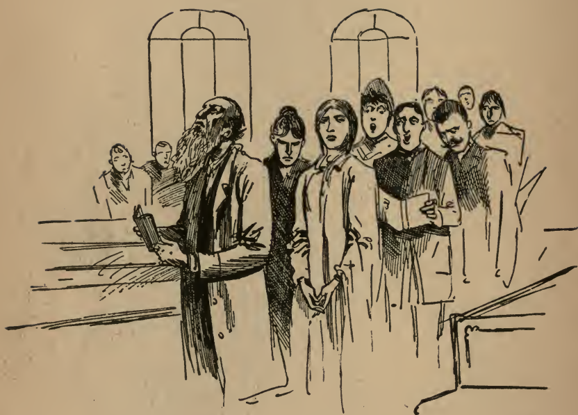
SHE DESCENDED FROM THE TABLE WITH HER GRAVE CLOTHES ON.