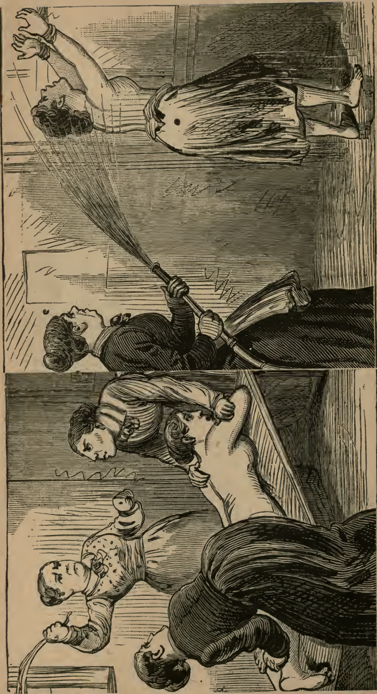
TORTURING AN APOSTATE.