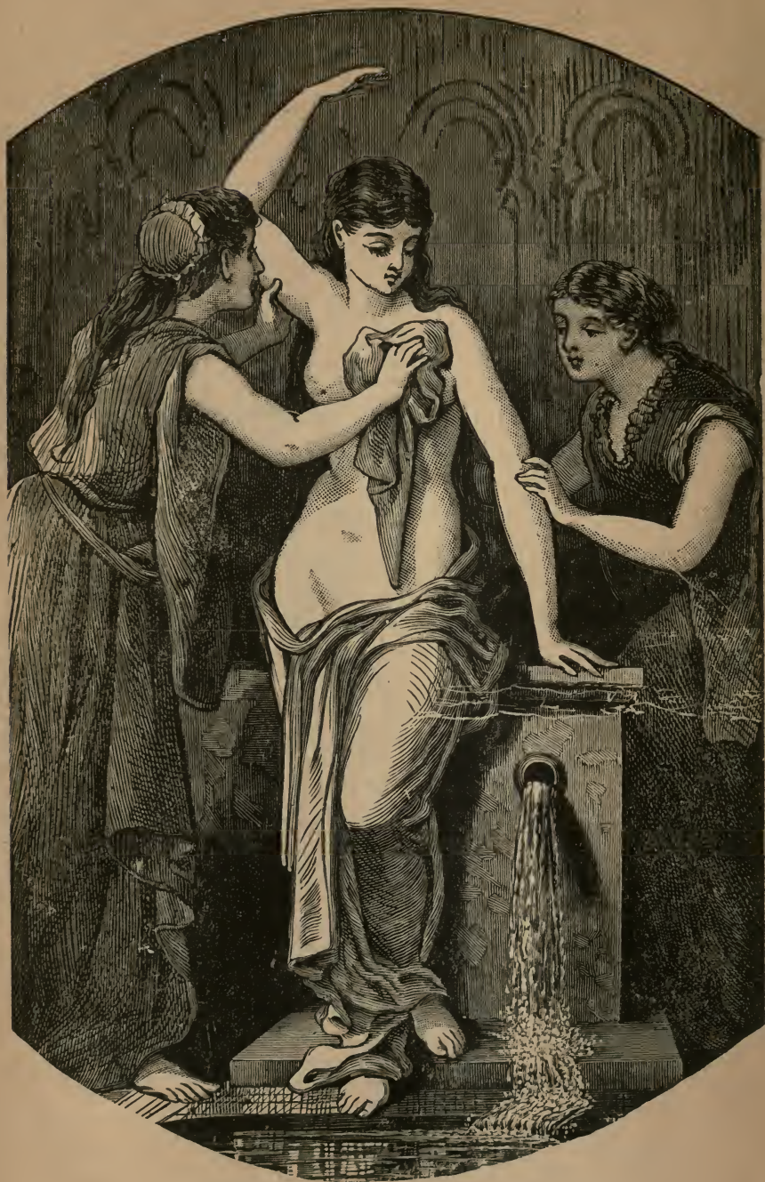
IN THE HOLY BATH.