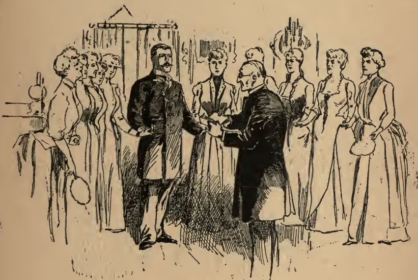
A WHOLESALE MORMON.