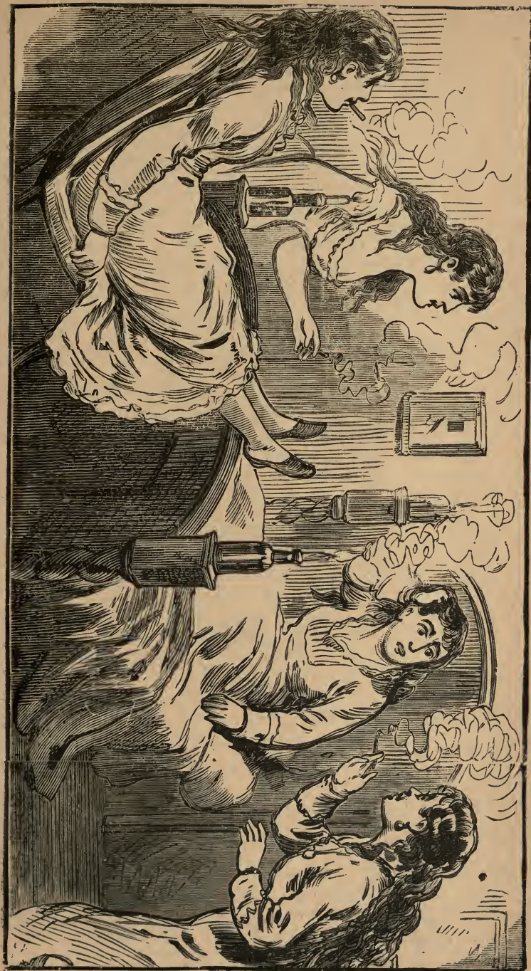
WAITING FOR THE OLD MAN.