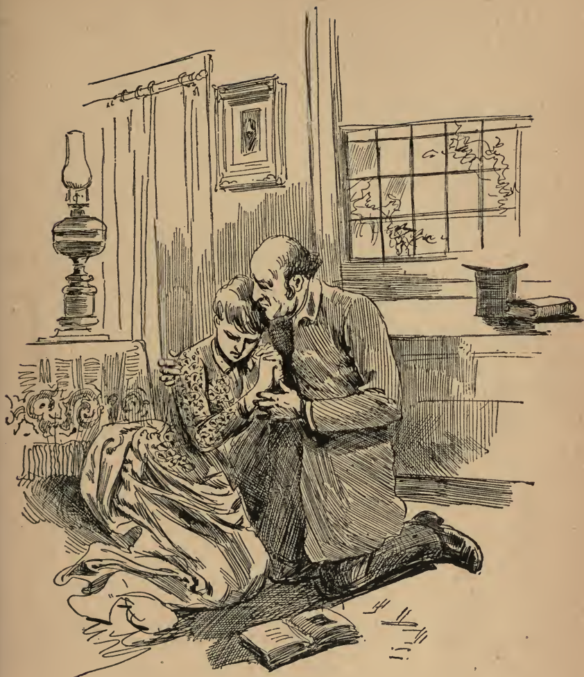
WORKING HARD TO SAVE (?) A SOUL.