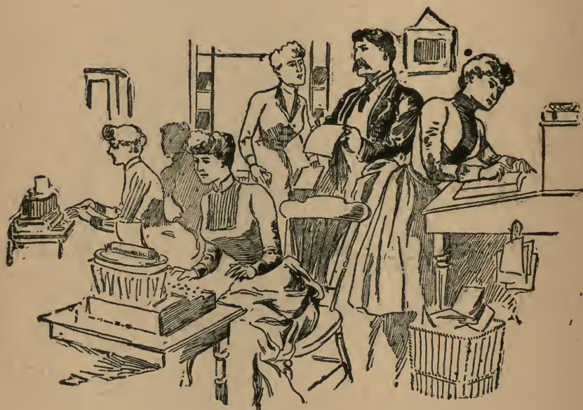
MADE GOOD USE OF HIS WIVES.