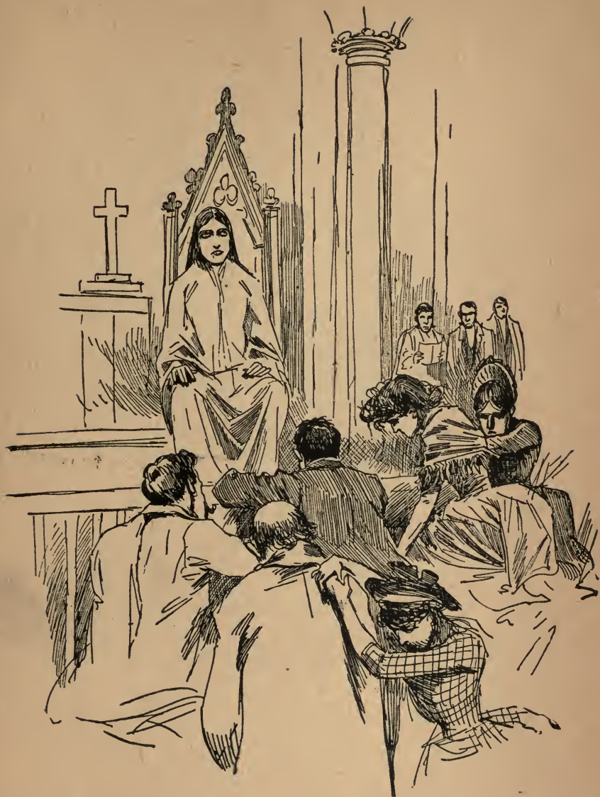
AT LAST THE BODY SAT UP.