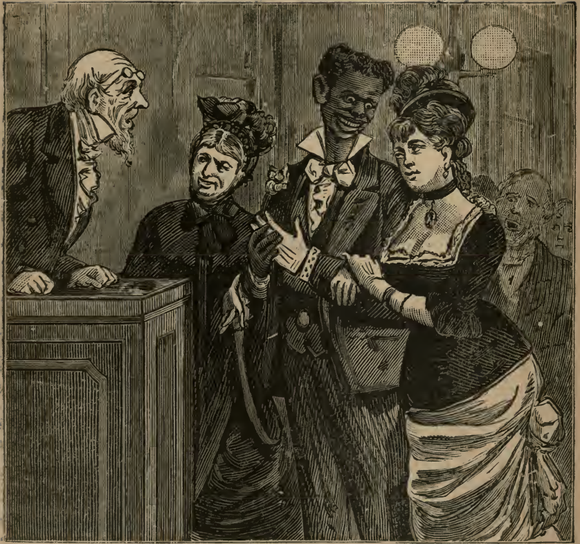
A "CULLUD" MORMON.