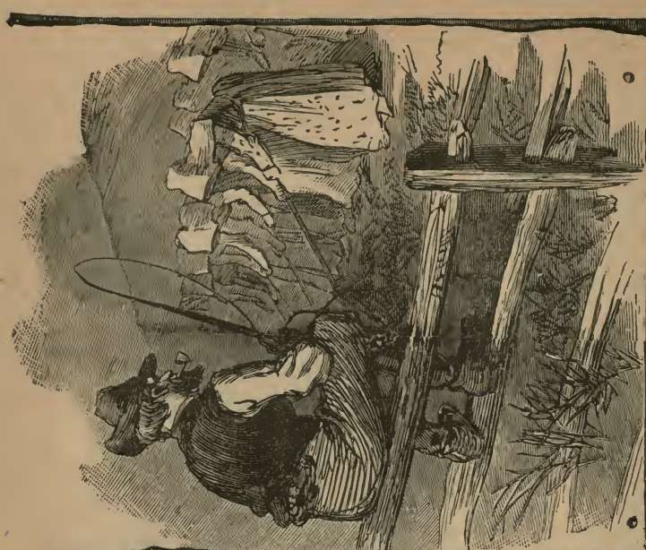
WIVES AS SLAVES