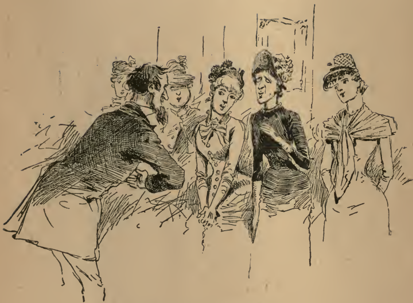
A CANDIDATE FOR ADMISSION.