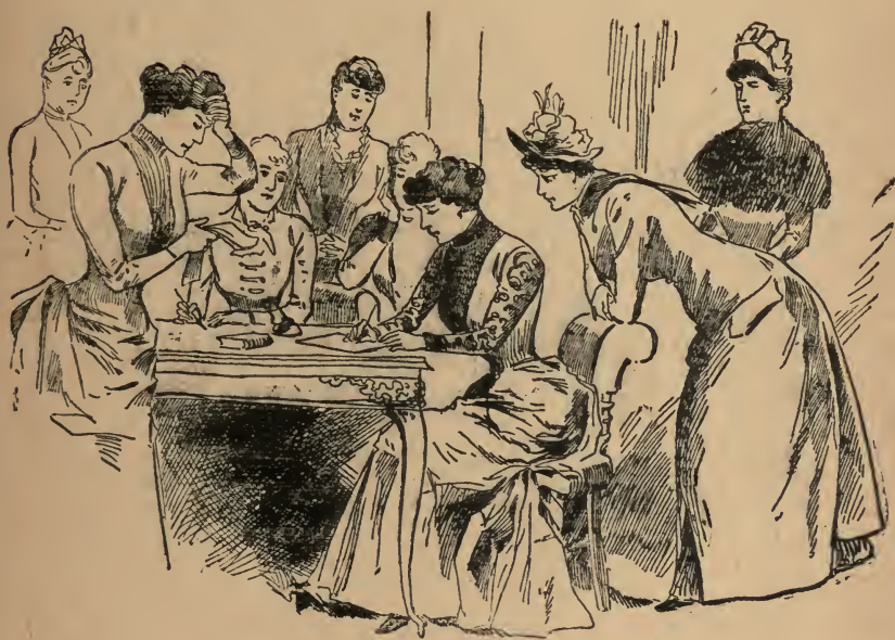
THE WIVES OF A WEALTHY MORMON.