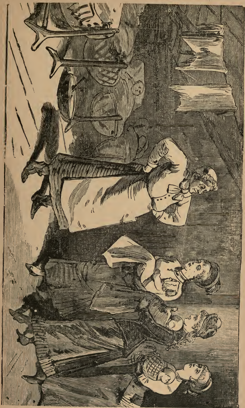
A MORMON BABY FARM.