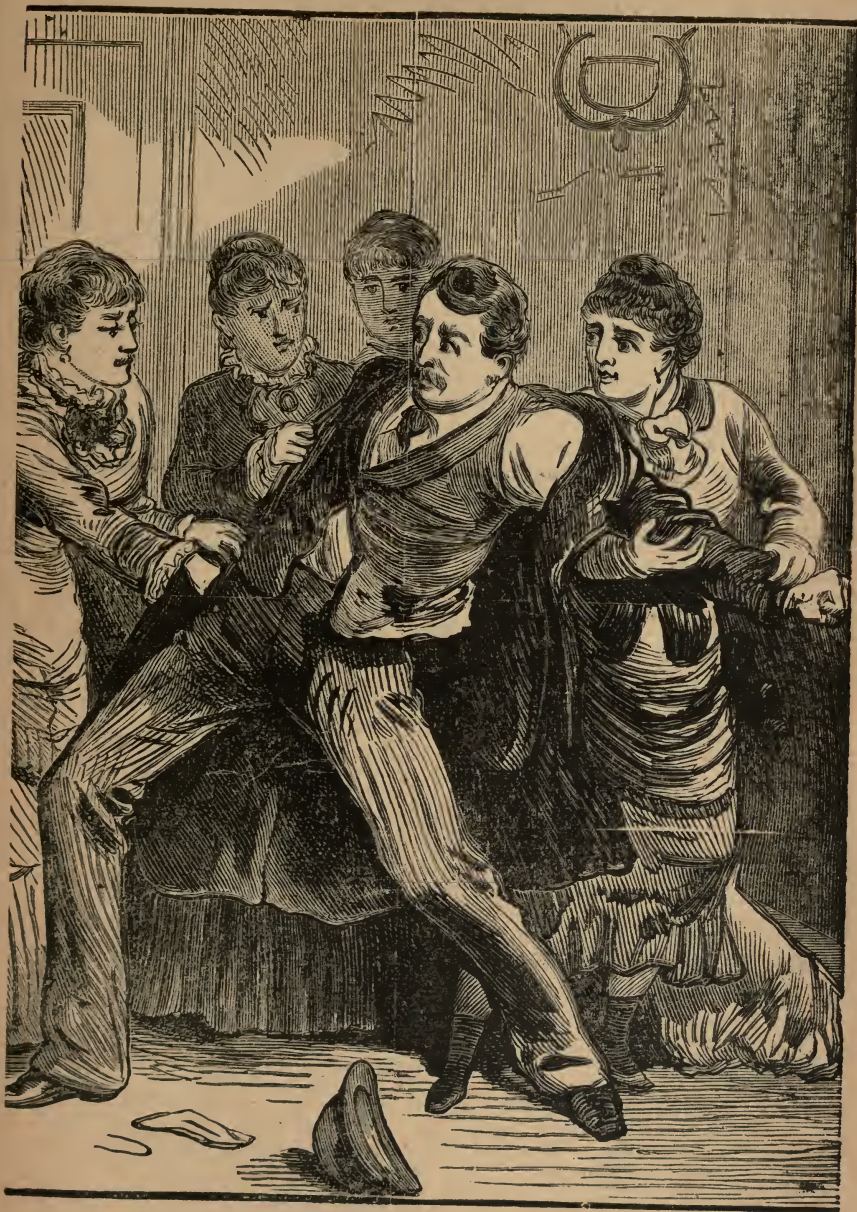
TOO MUCH MOTHER-IN-LAW.