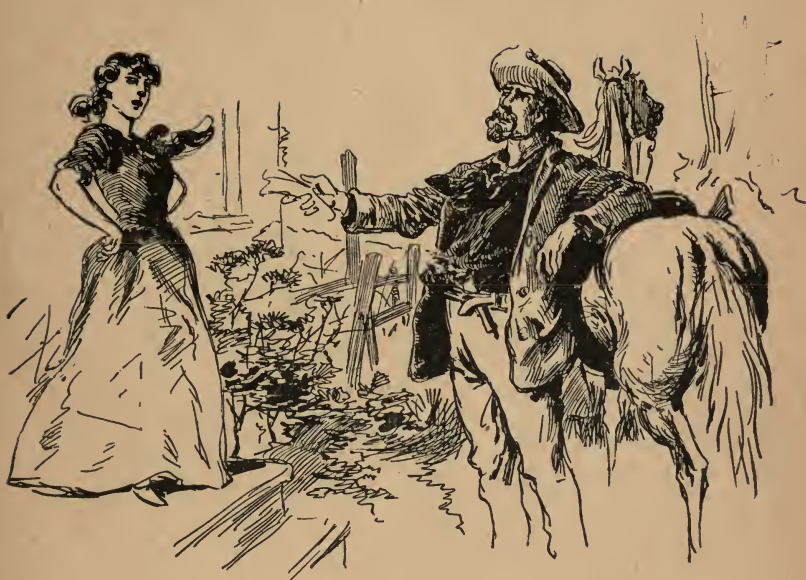
BIDDING FOR A WIFE.