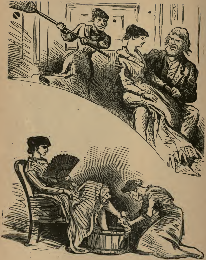
A YOUNG WIFE'S GLORY DAYS.