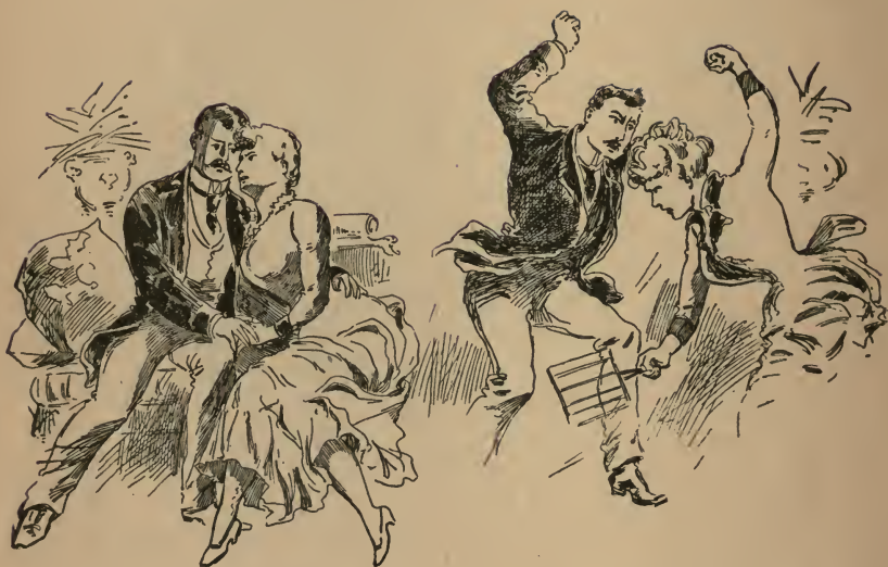
HOW THEY DO IT AND THEN RUE IT.